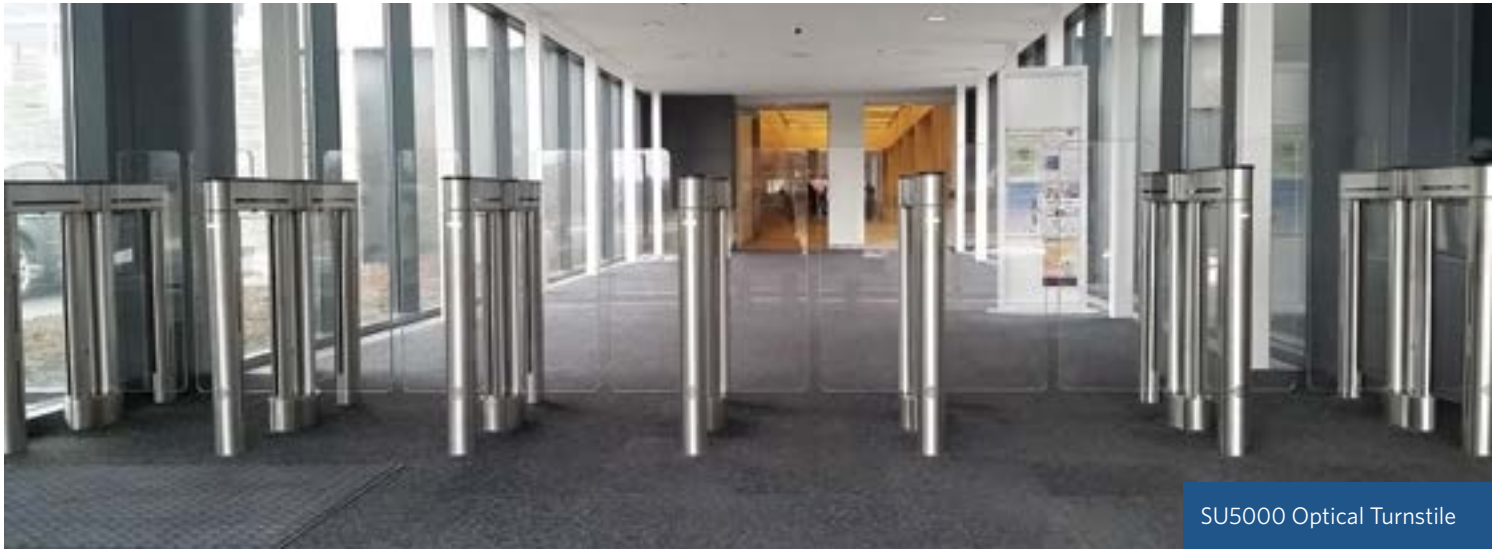
SU5000 Optical Turnstile