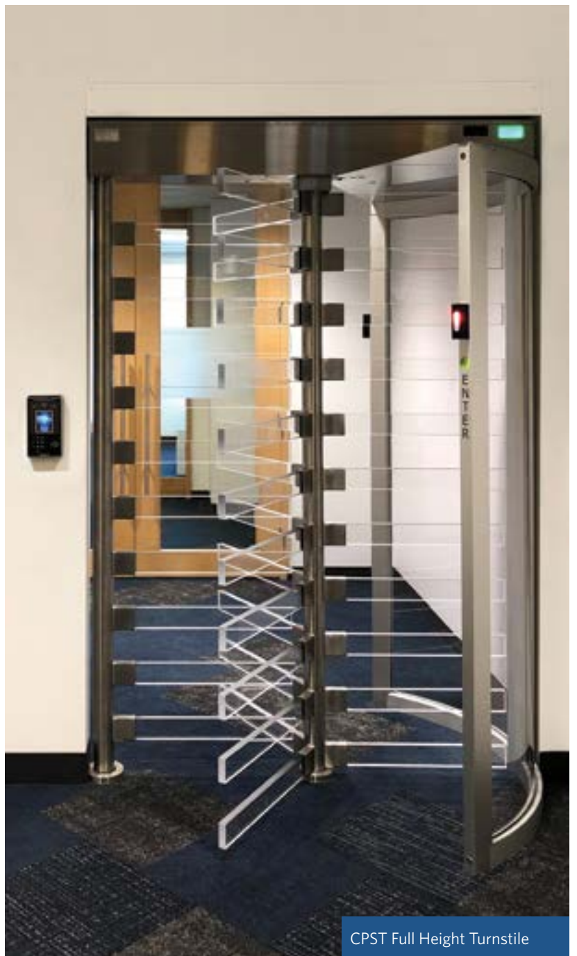
CPST Full Height Turnstile