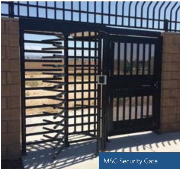
MSG Security Gate