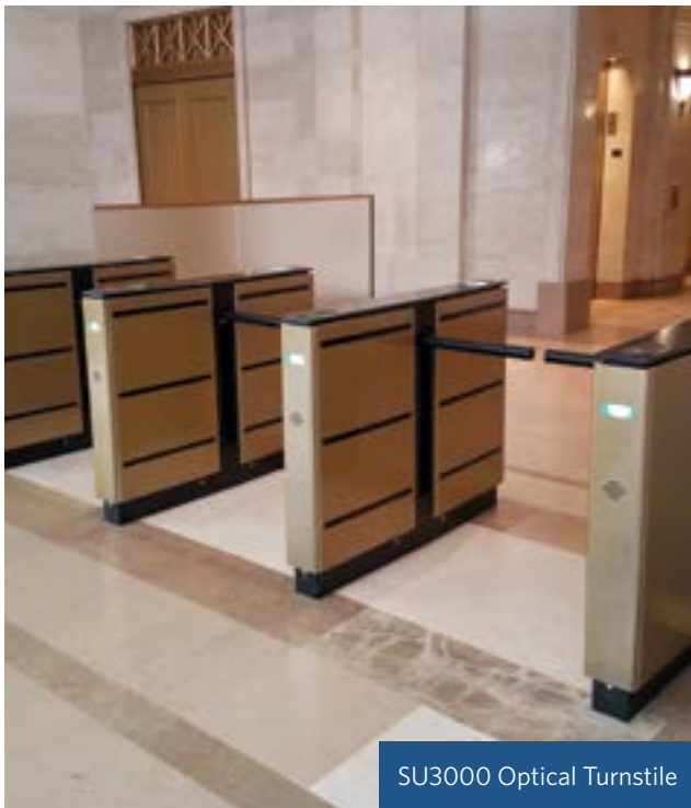
SU3000 Optical Turnstile