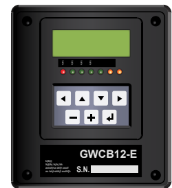
GWCB-12E Count Controller