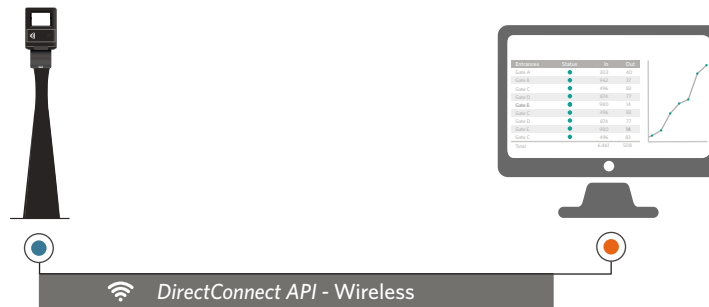
Third-Party Ticketing Software