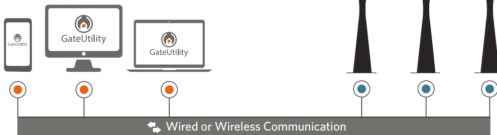
GateUtility Device Management Software