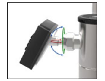
Adjustable Reader Mounting Attachment

Load cells are installed underneath the lid to detect an unauthorized user attempting to climb on the lid to gain entry.