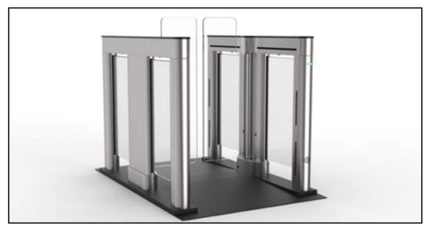
Floor Saving Platform