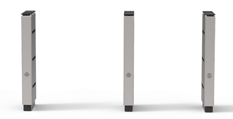
Multi-lane configuration with 36" passage width on left and 28" passage width on right

Center cabinets that have a 28" passageway on one side and a 36" passageway on the other side are available (shown right).