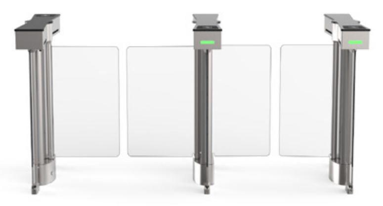
Multi-lane configuration with 36" passage width on left and 28" passage width on right

Center cabinets that have a 28" passage barrier on one side and 36" wide barrier on the other side are available.