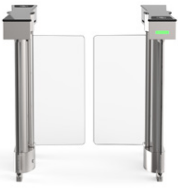
28" passage width

The SU4500 consists of a pair of end cabinets with moving barriers that create a single 28" wide passageway. The SU4500E is an extension center cabinet, with the same dimensions as an end cabinet, used to create additional turnstile passage lanes with the addition of a single cabinet. For example, one SU4500 and one SU4500E would be used to create two lanes. Additional extension center cabinets are used to create additional lanes; e.g., one SU4500 and two SU4500Es create three lanes. An unlimited number of center cabinets can be added.