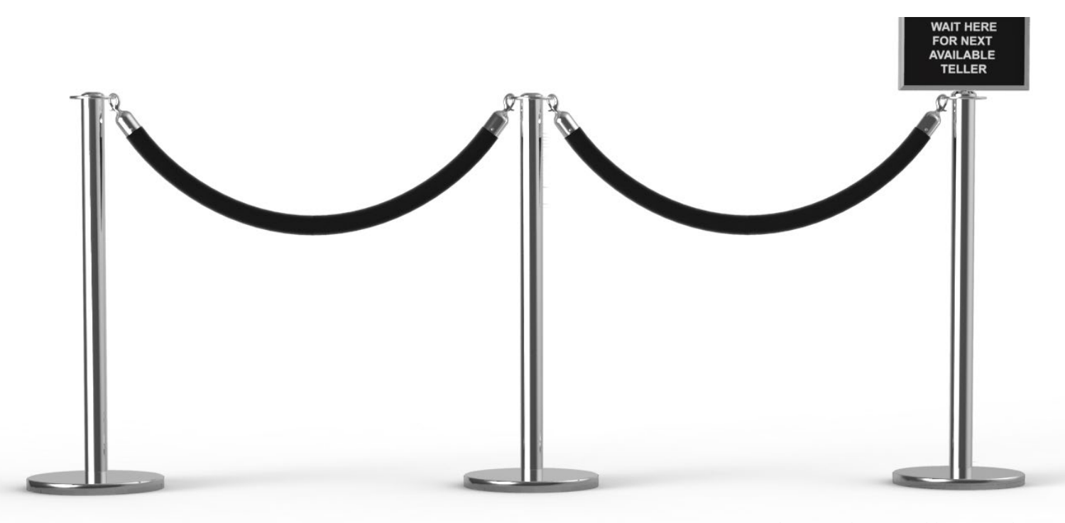
*Stanchions and ropes sold separately

Alvarado's classic rope stanchions provide a portable and decorative crowd control solution suitable for most queuing applications.