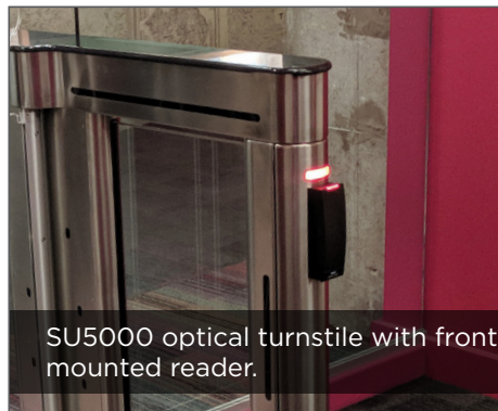
SU5000 optical turnstile with front mounted reader.