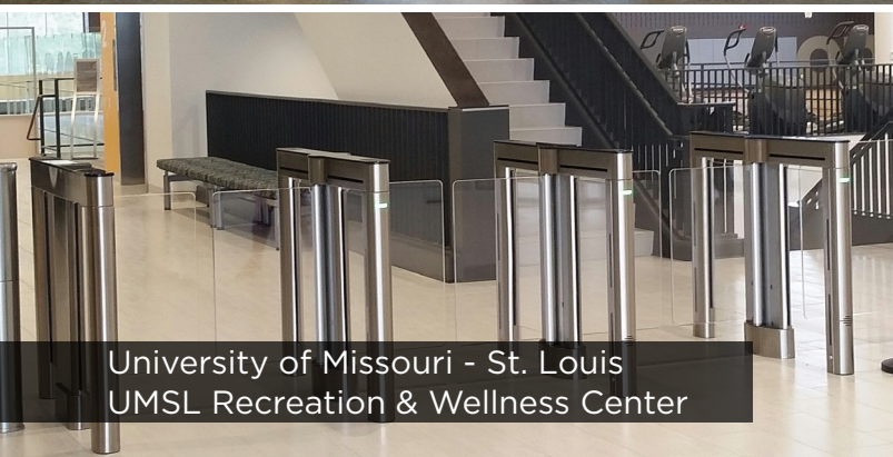
University of Missouri - St. Louis UMSL Recreation & Wellness Center