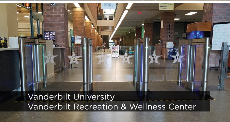
Vanderbilt University Vanderbilt Recreation & Wellness Center