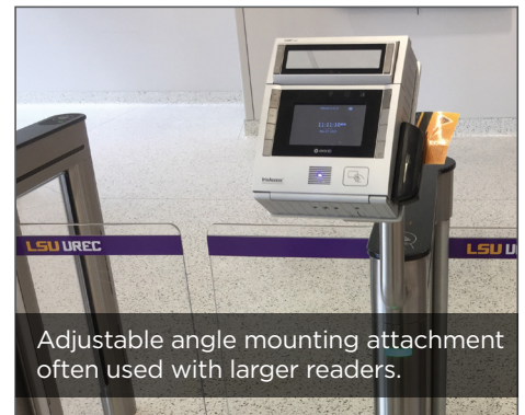
Adjustable angle mounting attachment often used with larger readers.