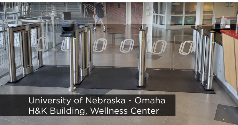
University of Nebraska - Omaha H&K Building, Wellness Center