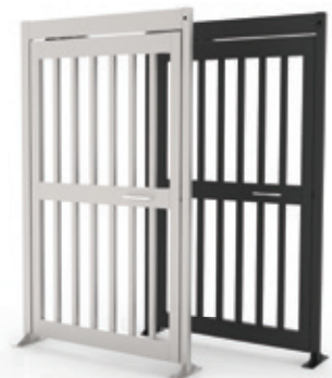
MSG Pedestrian Gate