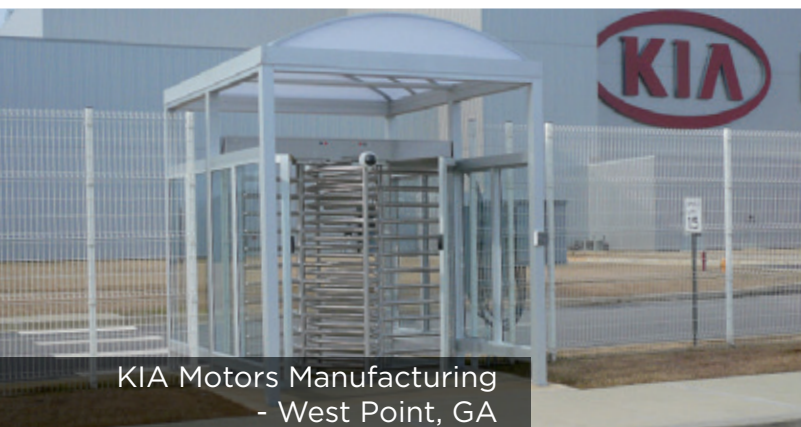
KIA Motors Manufacturing - West Point, GA