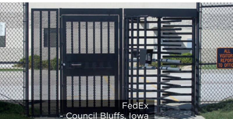
FedEx - Council Bluffs, Iowa