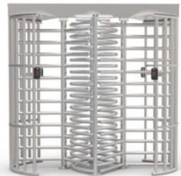
MSTT Tandem Full Height