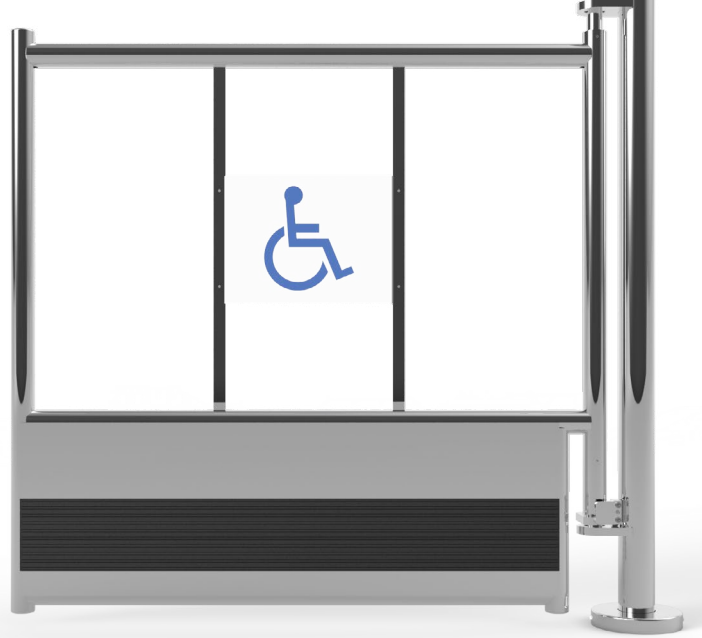
Shown with black bumper strip. Black bumper strip ships unattached, allowing placement on crash plates desired location by customer.

Fabricated from cold rolled steel with a bright chrome finish, CFG gates provide 36" of passage width and can be installed stand-alone, or in conjunction with Alvarado's modular post and rail and/or turnstiles.