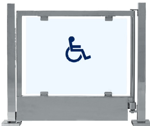
Shown with Acrylic Panel

VSG gates are fabricated from stainless steel. The standard finish is #4 satin (brushed satin). A bright #8 (mirror) finish is also available.