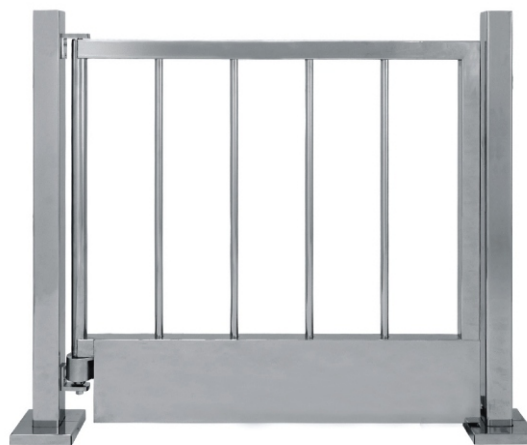
Shown with Infill Bars